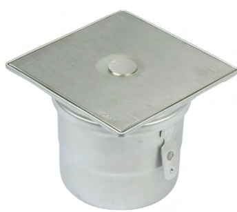
BCO-114 & BCO-116